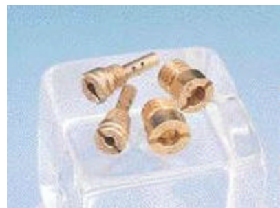
Pilot and Main Jets

Replace the Pilot Jet with one size larger. This of course assumes that you are starting out with the stock jet size. Harley Davidson Pilot Jets for CV Carburetors are normally sold in sizes 40, 42, 45, 48, 50, and higher. A Stage 1 Carb Kit will normally offer you a proper range of jets for your particular model. If your stock jet was a #42 the next size larger will be #44 or #45. Only increase the jet sizing one size at a time to avoid an overly rich idle. An EZ-Just mixture screw will also assist in fine tuning once you have the correct jetting.